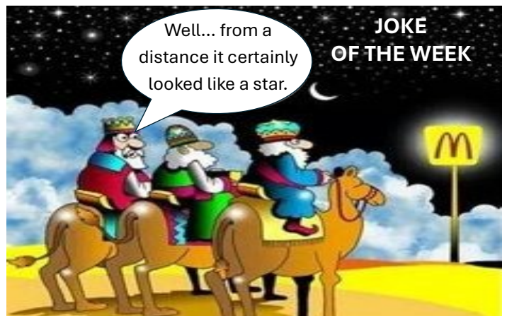
JOKE OF THE WEEK

If nothing we do matters, then all that matters is what we do - Joss Whedon